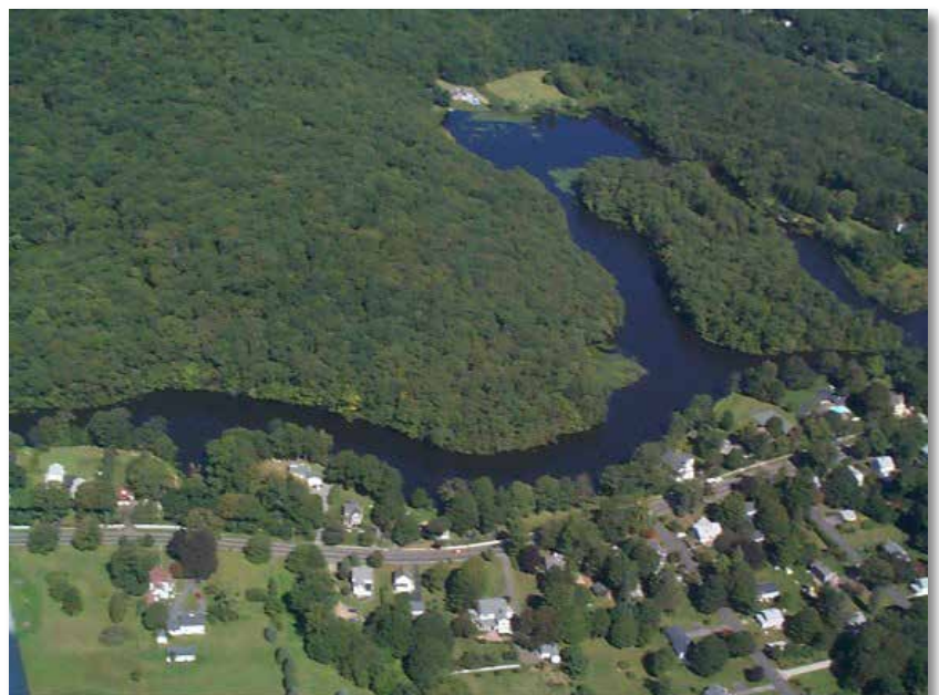
Aerial View of Falls River Mill Pond and Jean's Island

In the end, Chet Arnold, speaking at the dedication of the Falls River I property summed it up for all the land preservation efforts: “We owe this victory to the town, the state and to the many private donors who made it all possible.”