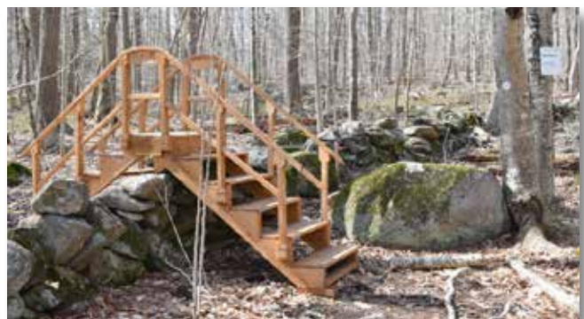
Stone wall bridge built by Bill French

The smaller Windsor Lane acquisition is relatively flat but is strewn with rocks and covered with the Japanese Barberry. A week or so of cutting these invasive plants and leveling created an easy path to an old stone wall. Adhering to the steward's policy of leaving old walls in place, the Land Trust asked Bill French, a man seemingly compelled to build things, to construct a bridge spanning the old wall. With the bridge installed, the first leg of the Ivoryton/Essex trail was in place.