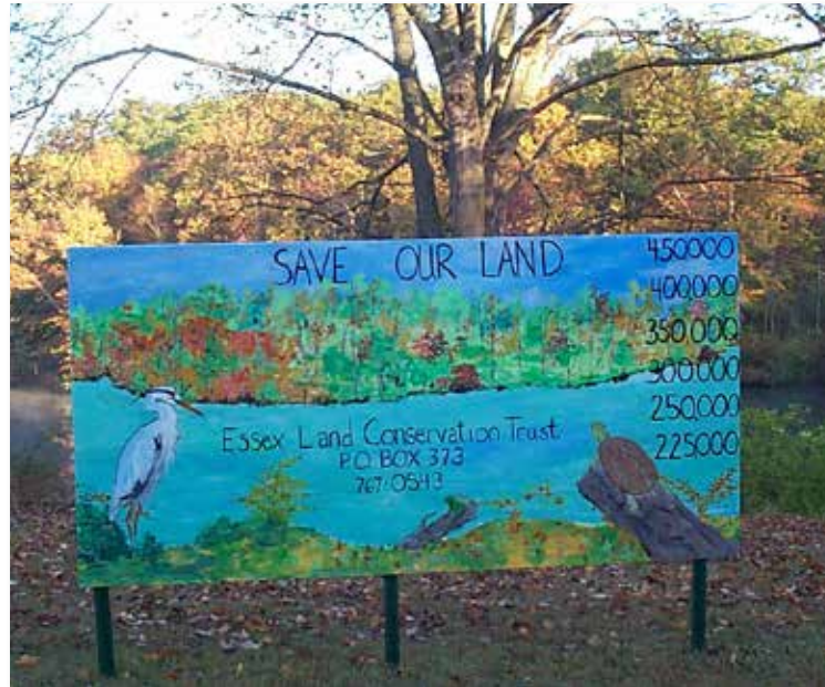
Falls River Initiative Fundraising Sign

As most Essex residents know, the Falls River is a tributary of the Connecticut, connecting the town’s three villages of Ivoryton, Centerbrook and Essex as it flows from west to east. About 70% of Essex lies within the 18